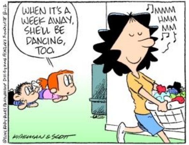
©2011 BABY BLUES PARTNERSHIP. DISTRIBUTED BY KANGAROO PUBLISHING. B-12.